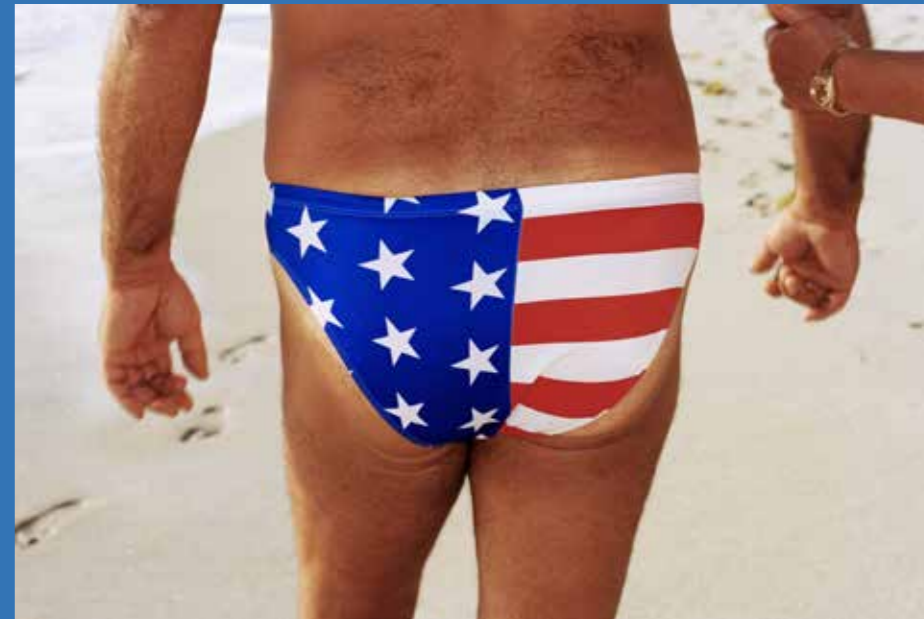
Miami, Florida, Etats-Unis, 1998.