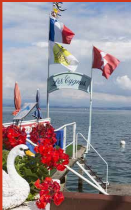
Hôtel Les Cygnes, Evian, France, 2015.