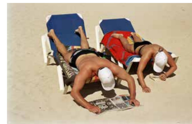
Sunbathing and reading on the beach. Magatuf, Majorca, Spain, 2003.