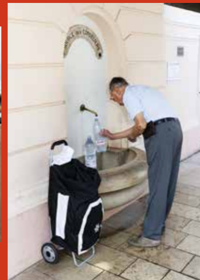
Source, Evian, France, 2015.