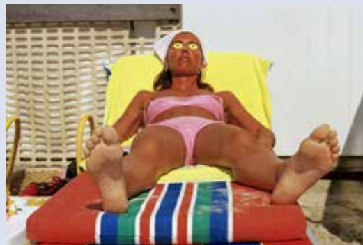
Knokke, Belgium. 2001.

Parr was invited to Evian by Evian Council in July 2015 and covered every square inch of the town, taking photographs of iconic spots for both the locals and tourists - the Evian bottling factory, La Savoie sail boat, the thermal baths, a CGN launch, the Hôtel Royal, a dog groomer, Charles-de-Gaulle Square, Cachat Spring, the Evian Resort golf course, a cheese dairy, the swimming pool... Most of