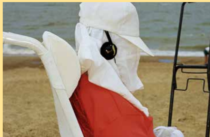
Knokke, Belgique, 2001.

The artworks produced in the workshops will be displayed from Sunday 20 December to Sunday 10 January at the Palais Lumière (Salle Commission Nord), free entry.