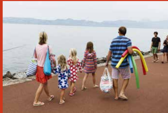
Evian, France, 2015.

Magnum Photos was founded in 1947 by four photographers - Henri Cartier-Bresson, Robert Capa, George Rodger and David 'Chim' Seymour . They created Magnum Photos in their image, i.e. a photography cooperative which places just as much emphasis on what is seen as the way in which it is seen. The cooperative was initially headquartered in Paris and New York and also has offices in London and Tokyo. Magnum Photos radically moved away from standard media practice at the time it was founded. It is a cooperative of shareholder-photographers and the photographers retain all copyrights to their own work. This enables the photographers to be independent, which in turn makes them committed. They select assignments and their length, choose the images, retain all the rights to their negatives, hold the copyright and control the circulation of the photos. The new member recruitment process is lengthy. Applicants remain under observation for a period lasting anything from four to eight years before being able to become full members and therefore shareholders. Photographic style, diligence and a long-term commitment to document and inform through photography are used to assess applicants' uniqueness. The cooperative currently comprises close to 80 photographers, 60 of whom are members.