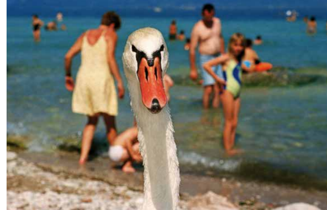
Lake Garda, Italy, 1989