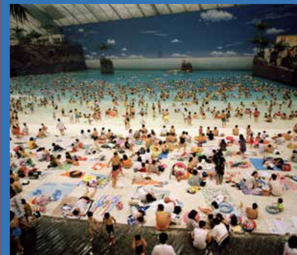
The artificial Ocean Dome beach. Miyazaki, Japan. 1996.