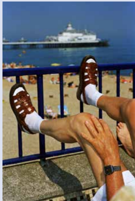
Eastbourne, UK, 1995-99.