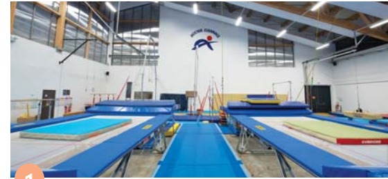
1 Léchère Gymnasium (Gymnastics, Handball)