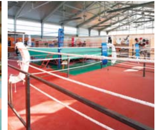
2 Anna de Noailles Complex (Judo Martial Arts, Table Tennis)