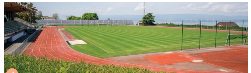
4 Camille Fournier Stadium (Athletics, Football)